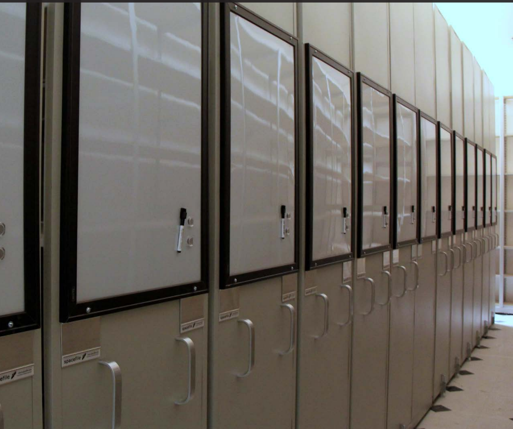
LT SHELVING, 3-PIECE ANTI-TIP ADA COMPLIANT TRACK - RETAIL

VERSATILE, CUSTOMIZABLE, COST-EFFECTIVE.